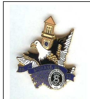
The Spokane, WA Branch #60 for 2002