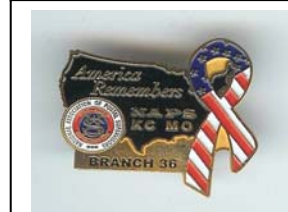
Branch 36, Kansas City MO pin for 2002