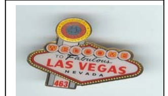
Branch 463, Las Vegas, NV pin for 2002