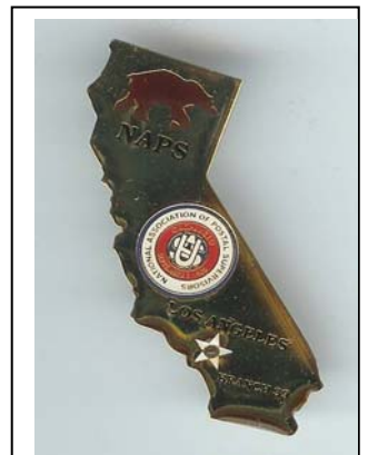
Branch 39 Los Angeles, CA pin for 2002